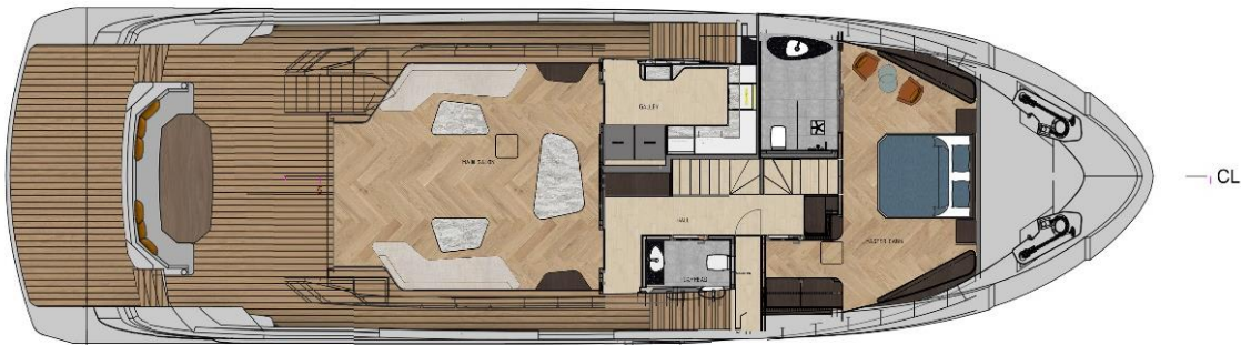
MAIN DECK PLAN