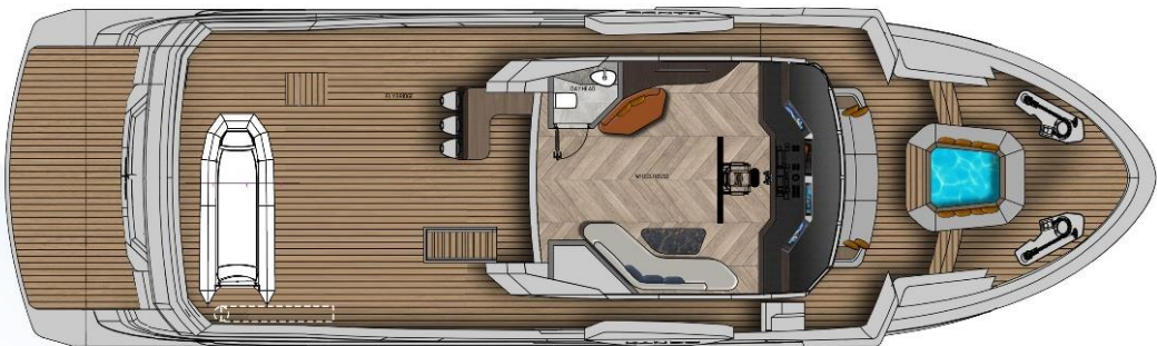
UPPER DECK PLAN